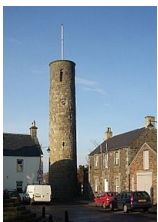
The round tower of Abernethy , built for the Celtic abbey of which a branch of Clan MacDuff were hereditary Abbots .

In 1306 during the Wars of Scottish Independence , Duncan MacDuff, Earl of Fife was as a minor, held by Edward I of England at the coronation of Robert the Bruce as his ward while Duncan's sister, Isabella MacDuff , placed the golden circlet upon King Robert's head. [5] As a result, when she fell into the hands of King Edward's army, she was imprisoned in a cage which was suspended from the walls of Berwick Castle . [5] Duncan MacDuff later married Mary, the niece of King Edward, and threw in his lot against the Bruce. [5] However, he was captured and imprisoned in Kildrummy Castle where he died in 1336. [5] The Earldom later fell into the hands of Robert Stewart, Duke of Albany , however, although the MacDuff family lost their rank, they continued to prosper. [5] In 1384, the earl of Fife was described as capitalis legis de Clenmcduffe , meaning chief of the law of Clan MacDuff . [8] In 1404, David Duff received a charter from Robert III of Scotland for lands in Banffshire . [5]